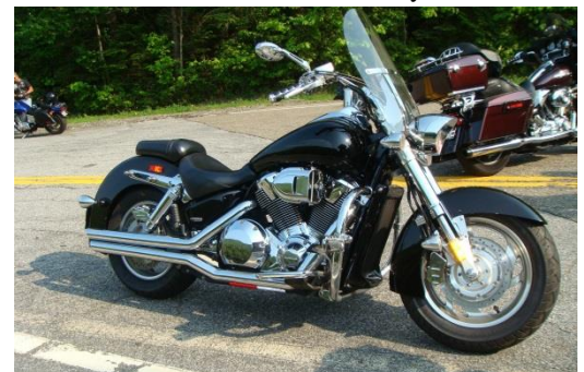
2005 Honda VTX 1800N