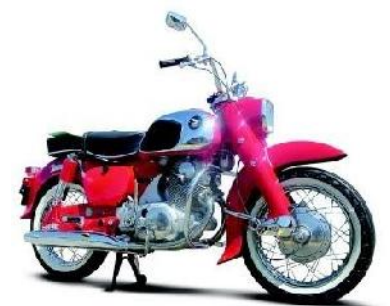
1963 Honda 305 Dream