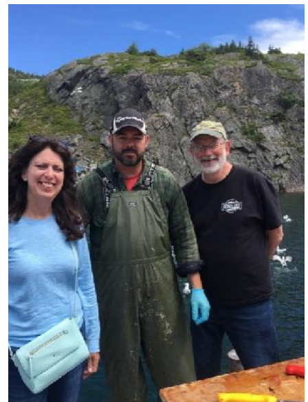
My wife, cousin and me

QuidiVidi and were watching two men filleting a number of cod they had just caught. They said we could come over closer and we struck up a conversation with them. We said we were from NY, they asked if we were Rangers fans (they were), and asked if we were to be in St. Johns for long. I said we were in town just a day or two because we are going to take a trip to the Burin Peninsula to visit the towns where my parents were from. I got a strange look and