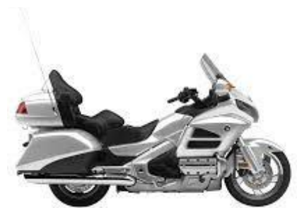
2015 Honda Gold Wing