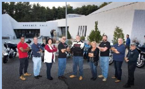
A fun evening at the hurricane fundraiser