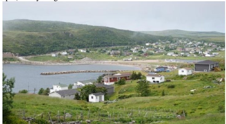
My mother's town

told him we were going to the towns of Lawn and Point May. He said he had family from Point May and asked my last name. Well ... it ended up that his