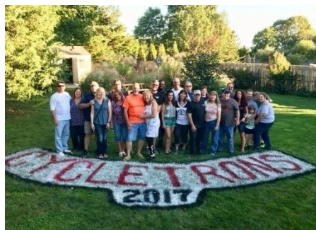
Cycletrons' Summer BBQ

For just $10/year, that's less than 84 cents a month, you can become a member of the Cycletrons Motorcycle Club and enjoy the benefits of riding with people who share your passion for motorcycling. So what are you waiting for? Contact Terri Diaz at 631 344-2970 or tdiaz@bnl.gov . And visit our website at: www.bnl.gov/bera/activities/mcycle/